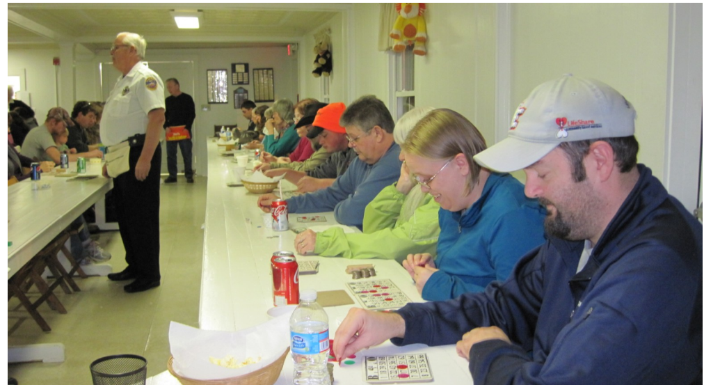
Scenes from the Parkman Feather and Oink Bingo Fundraiser supported on November 23, 2013