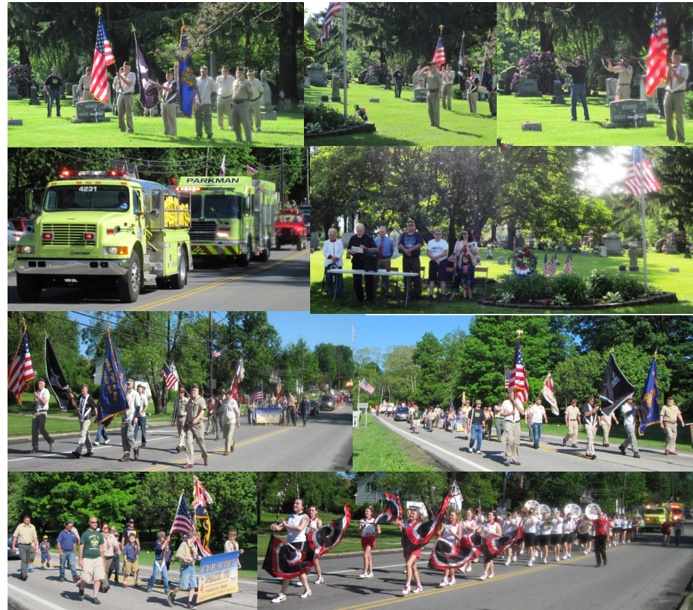
Scenes from the 2017 Memorial Day Parade above and Scenes from some of the 2017 Pancake Breakfast Chefs below.