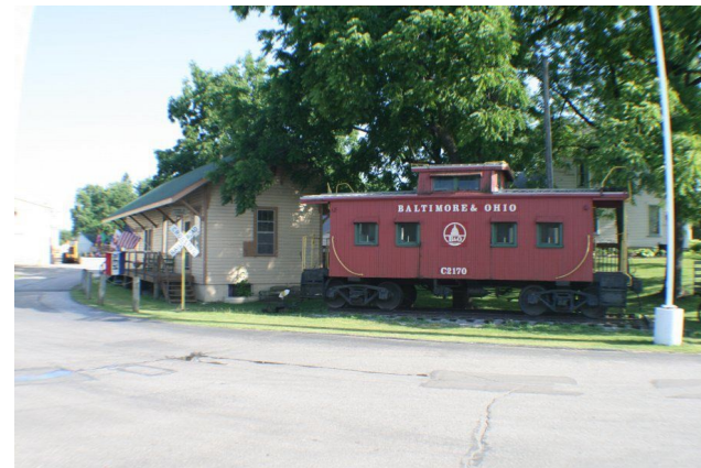
Depot Ice Cream in Middlefield