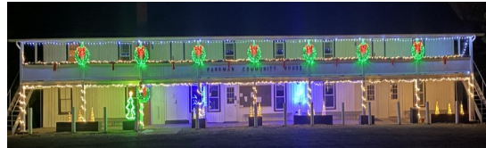
Below are some photos from Breakfast with Santa and the holiday decorating. Thanks to everyone who helped support these and all of our activities!

Denise Villers (440) 548-2939 denise.villers17880@gmail.com